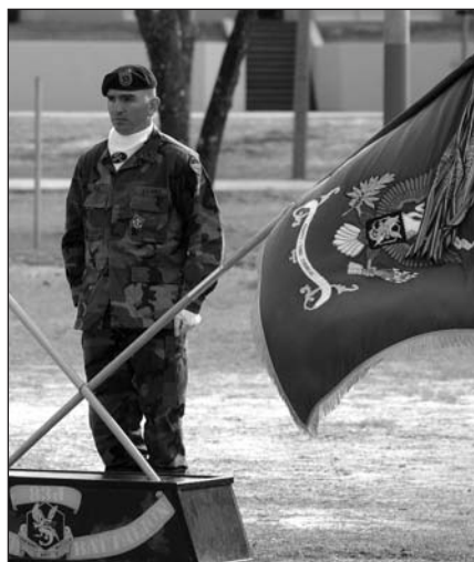
The current soldiers of the 83rd Chemical BN are proud of their lineage and legacy. They honor the original 83rd CMB by wearing its patch.