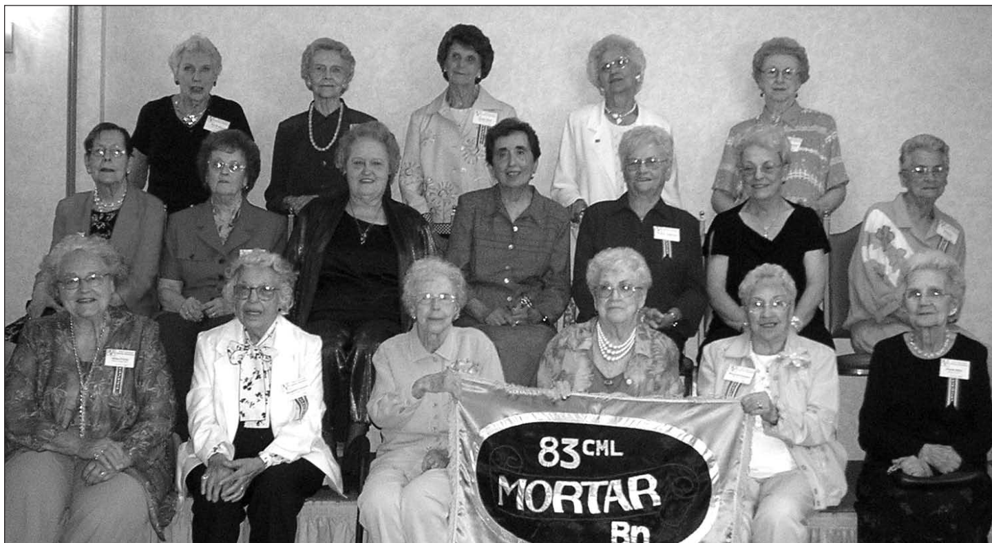
These lovely wives and widows attended the 2005 Reunion in Gettysburg