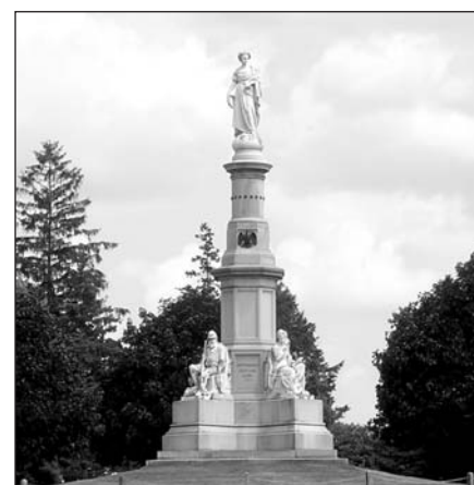
Many of our 83rd CMB Veterans and their families stopped to remember the fallen soldiers of the horrific Battle of Gettysburg.

When it ended, we all found ourselves still in one piece. We then ran like hell and got back to our own position. It was no safer, but at least we were "home." □