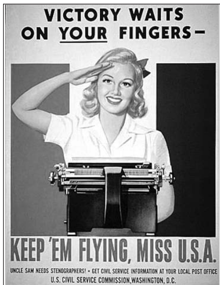
Poster image from the National Archives and Records Administration

This space features relevant personal stories by the "Ladies" of the 83rd.